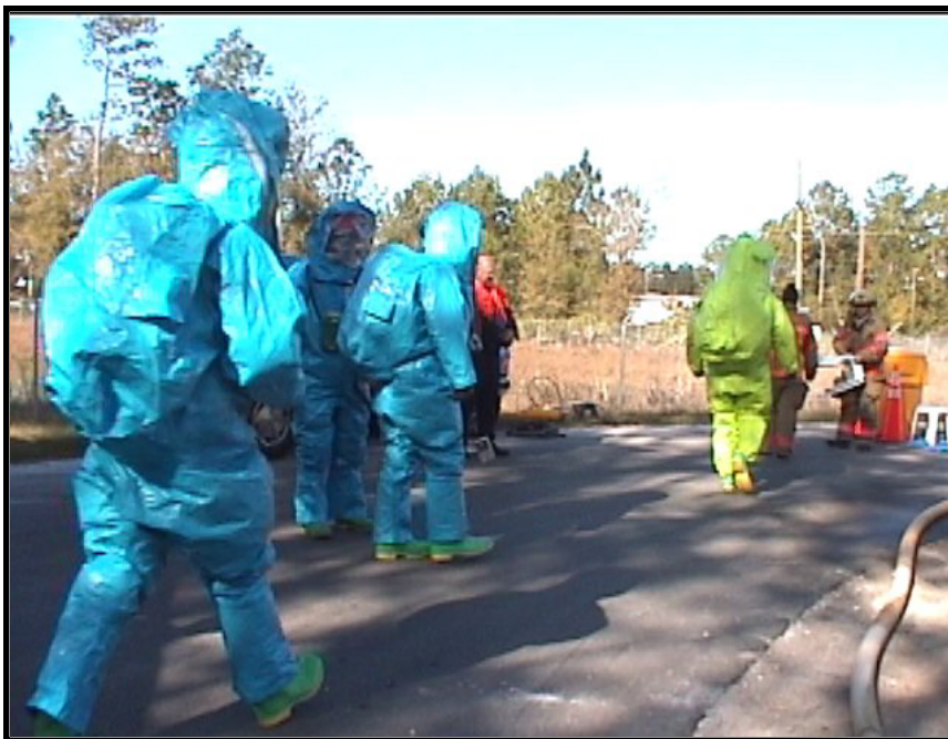
Hazmat Team heads for the hot zone.

To obtain FREE copies of any or all of these maps, contact the Council by phone: 352/955-2200 or by Email: ncfrpc@ncfrpc.org . Businesses may wish to obtain a supply of these maps. Hurry, get your copies while they last!