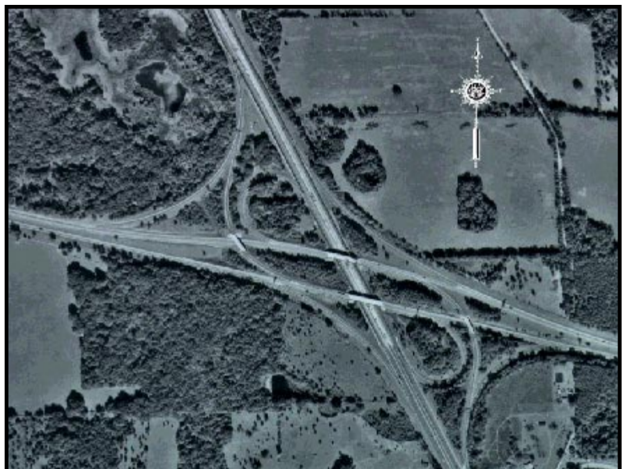
Aerial View of I-75 at I-10 in Columbia County

North Central Florida Areawide Development Co., Inc. - http://adco.org