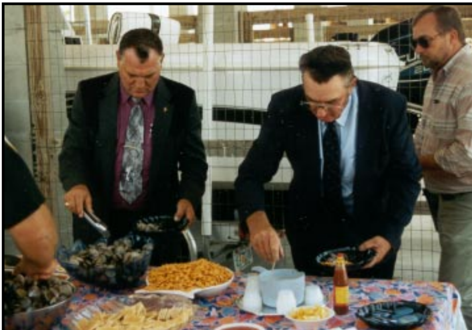
Tasting the Product (Clam Nursery in background)

Local governments should receive initial notification of the success of their application(s) in October.