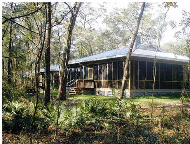
New cabins have 2 bedrooms, a full kitchen and a screened porch.

"The Suwannee River Wilderness Trail offers a one-of-a-kind outdoor recreational experience that will draw thousands of people to boost this rich community of natural and cultural heritage," said Secretary of the Florida Department of Environmental Protection, Colleen Castille.