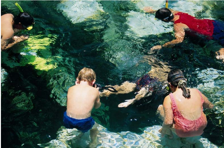
Explore The Original Florida—find local events in your area at: www.OriginalFlorida.org under “Calendar of Events”