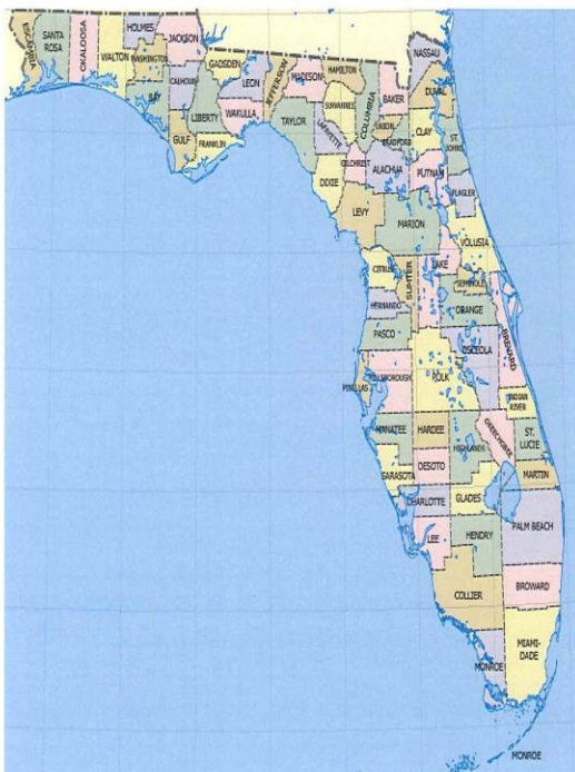
Florida State Map 67 Counties